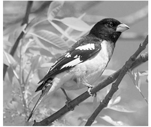
A Rose-breasted Grosbeak

mean when you say there's nothing there? Amazing isn't it - especially amazing when you think that we are so close to a major city surrounded by fairly dense communities and agricultural land.