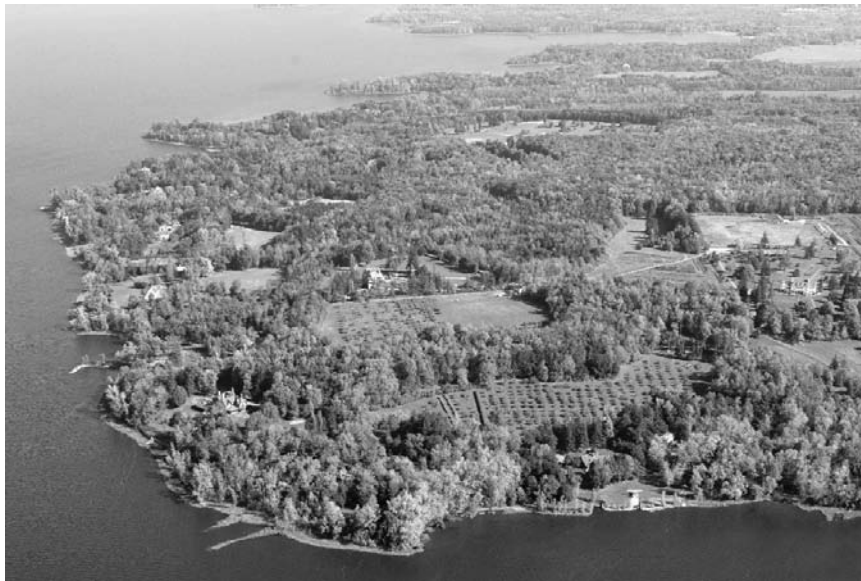
Aerial view of the well conserved Senneville Woods.

(reptiles and amphibians), birds and mammals. To ensure that it continues to foster such biodiversity, it is essential for the Arboretum to stay connected to the natural ecosystems of the Rivière à l'Orme area by preserving a sizeable natural corridor within the Bois de la Roche agricultural park.