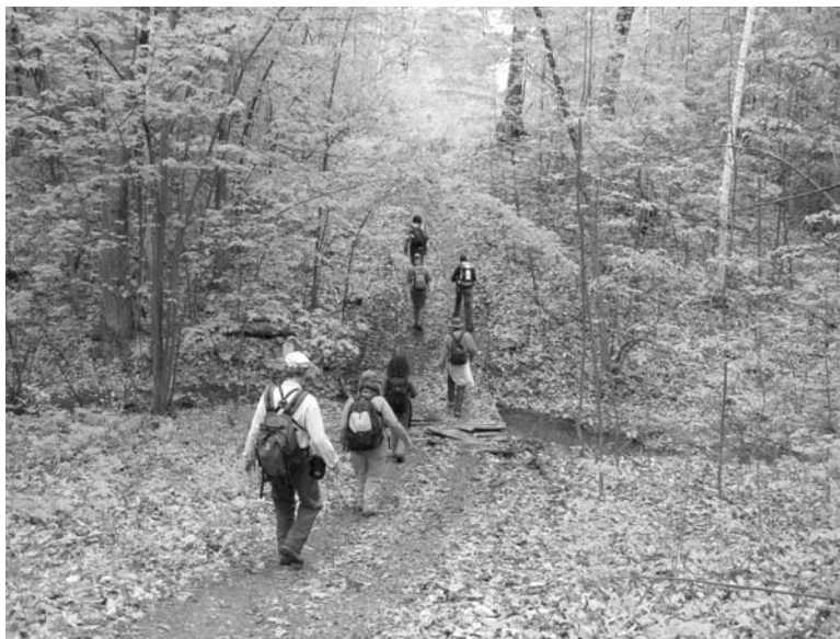
Birders surveying the forest during the MBO fundraiser

is "there's nothing there". How wrong you can be. Admittedly, the thick leaf cover can make bird sightings tricky at times but an attentive ear, a systematic scanning of the area you are walking through, and a simple pair of binoculars will bring the birds to you.