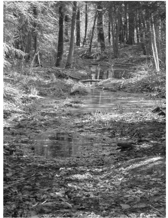
A submerged part of the snowshoe trail.

Water falls upon the Arboretum and enters one of its many watersheds, areas of land that drain water to a specific stream, river or lake. As water passes through the trees' leaves, enters the soil and filters through tree roots, the water often becomes cleaner than when it initially fell from the sky. After being trapped within the Arboretum, watershed water exits the property in many locations, both below ground as ground water and above ground in streams and drainage ditches, to feed the Lake of Two Mountains and Lake St-Louis. See if you can identify a few streams leaving the site during your next visit. Interestingly, one Arboretum watershed sends its